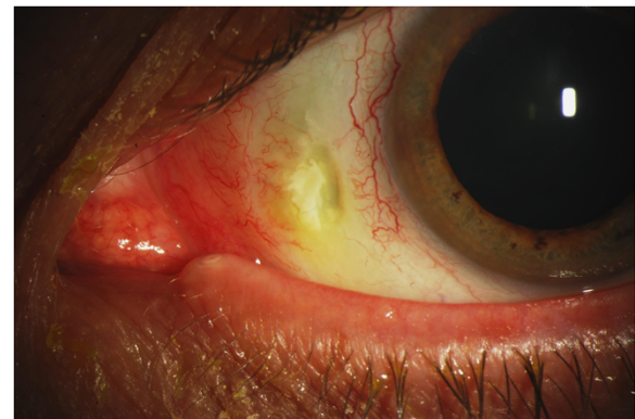
Figure 2 Necrotizing scleritis with associated calcium plaque, left eye.

However, the patient was reluctant to undergo further surgical procedures and elected alternative medical management with cyclosporine 1% and medroxyprogesterone acetate 1% eye drops. He has been maintained on these eye drops with close monitoring.