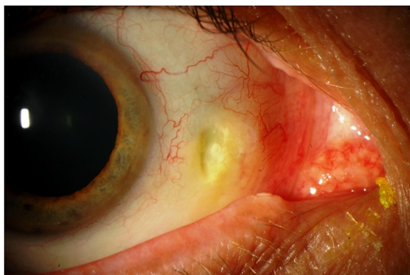
Figure 1 Necrotizing scleritis with associated calcium plaque, right eye.

Aggressive lubrication with preservative-free artificial tears and ointment was initiated, and the ketorolac was discontinued. Over the next 4 months, there was evidence of progressive scleral melting in both eyes. At that point, an amniotic membrane patch graft was recommended.