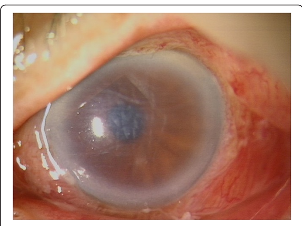
Figure 2 Slit lamp photography showed that corneal edema increased with Descemet's membrane folds 3 days after injury.

The patient was initially treated with topical antibiotics (ofloxacin, 0.3% at 6 times per day), topical steroid (dexamethasone, 2 mg/day at 6 times per day), and tropicamide (3 times per day). Subconjunctival steroid injections (dexamethasone, 2 mg/day for 2 days) were given until resolution of the epithelial defect. On the third day of treatment, the corneal epithelial defect decreased, but the corneal edema deteriorated with Descemet's folds (Figure 2). The anterior chamber flare and cells increased. The corneal endothelial analysis revealed 922 cell/mm<sup>2</sup>. Therefore, the anterior chamber was irrigated with oxiglutatione solution to rinse out the venom on the third day after injury. The next day, the anterior chamber was clear. Fundus examination revealed a grade 2 vitreous opacity. Three days after irrigation (6 days after injury), stromal edema and Descemet's membrane folds in the cornea increased and anterior chamber showed flare with uveitis again. B-scan ultrasonographic findings and fundus examination showed that vitreous opacity had increased. Therefore, we performed a 23-gauge sutureless vitrectomy to remove the vitreous opacity on day 6 after injury (Figure 3).